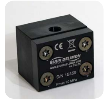
Lube Point Monitor (Part #55105)