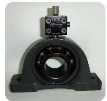
Lube Point Monitor shown with bearing. (Bearing not included)